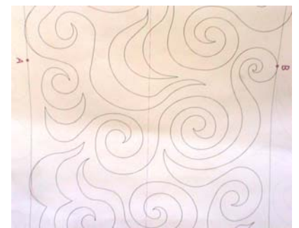
12.5” Windy Meandering