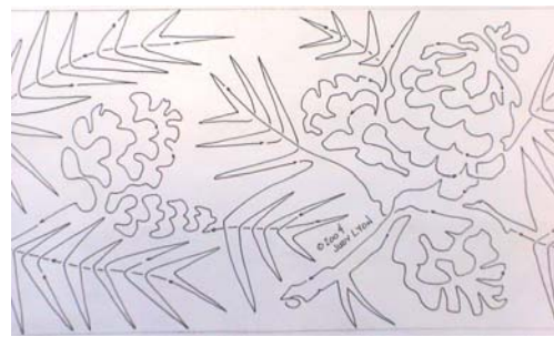
9” Ponderosa Pine Spray