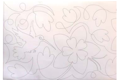
11.5” Columbines with Hummingbird