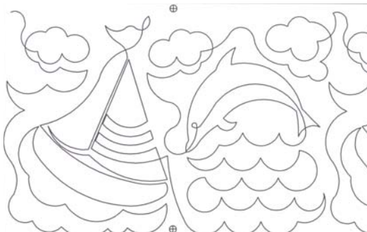
Sailboat with Dolphin