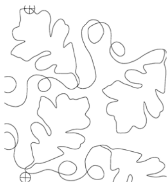
White Oak Leaf Meander