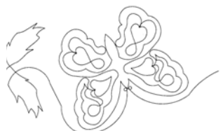
Pansy Garden with Butterflies