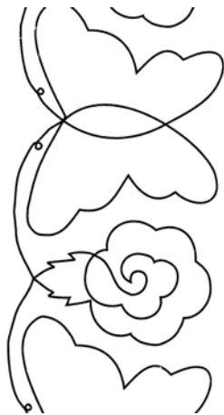
Butterfly & Rose